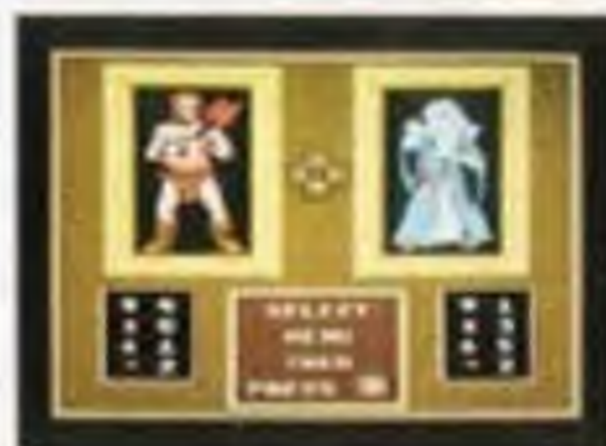
Player Select Screen